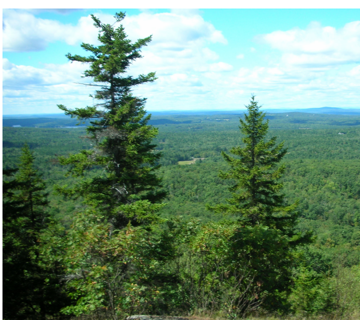
A view from the Wapack Trail