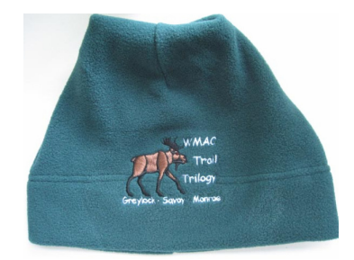
The 2010 Trilogy Series

Thanks and Congratulations to all runners who completed WMAC's 2010 Trilogy Series!