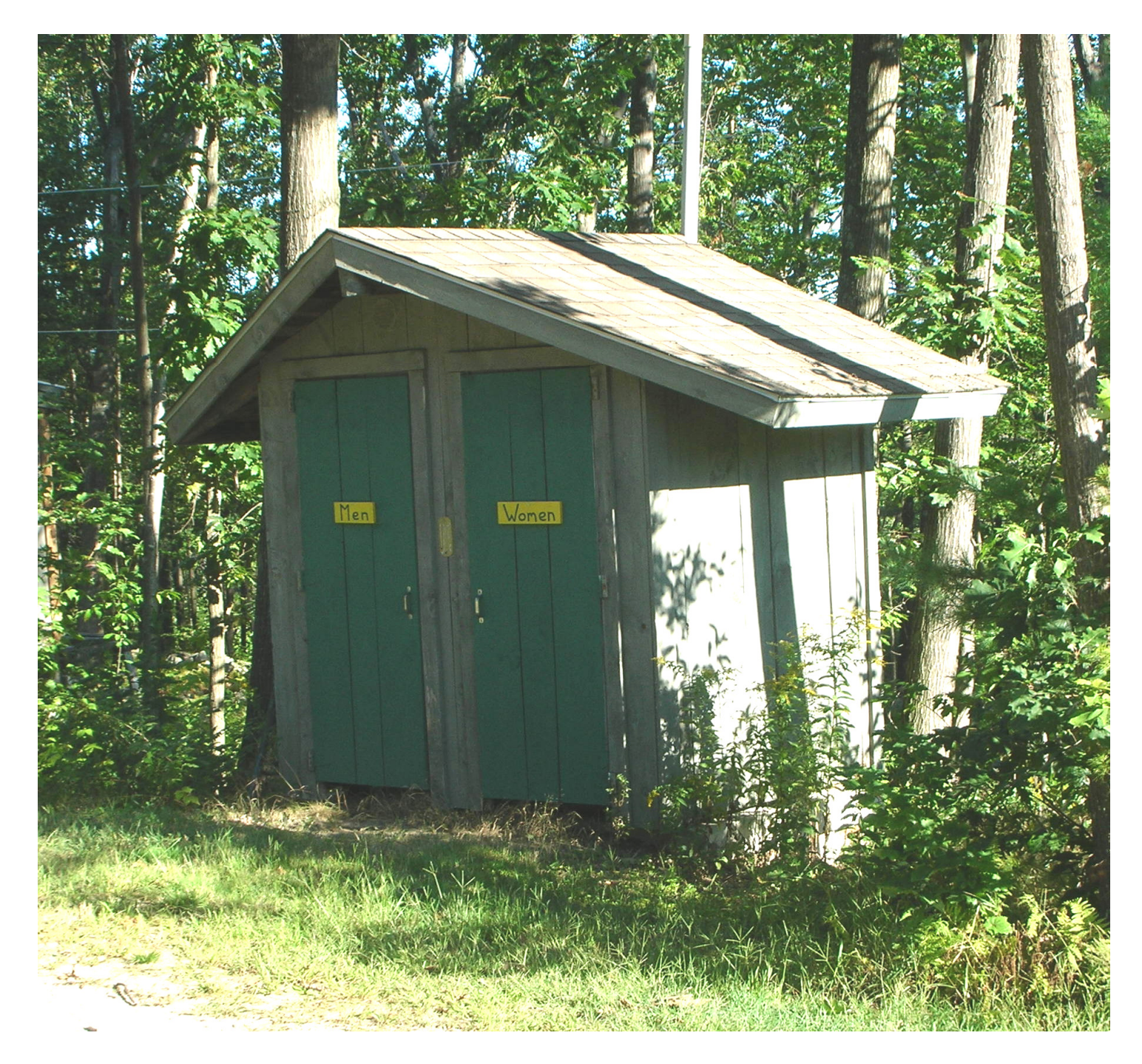
Bobby Worsham collects photos of outhouses. Can you identify the race that this double unit is located at?