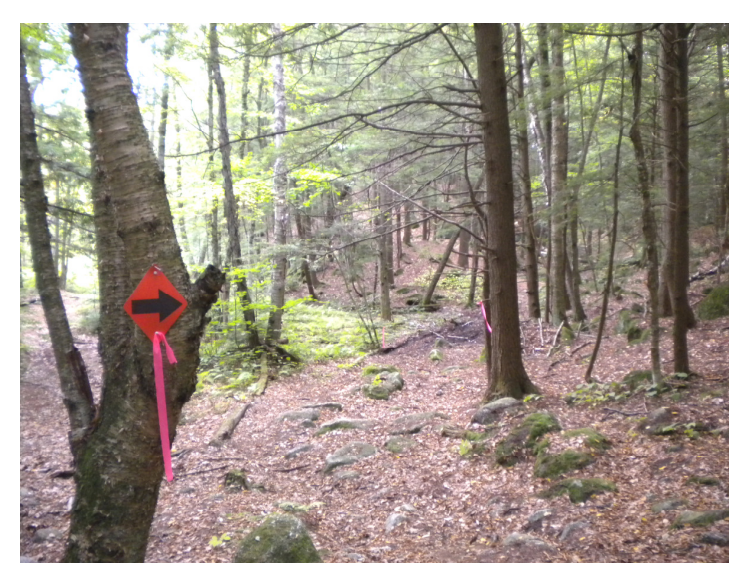
A rugged section of trail in the Pisgah Mt. State Forest